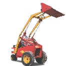
Compact Wheel Loaders