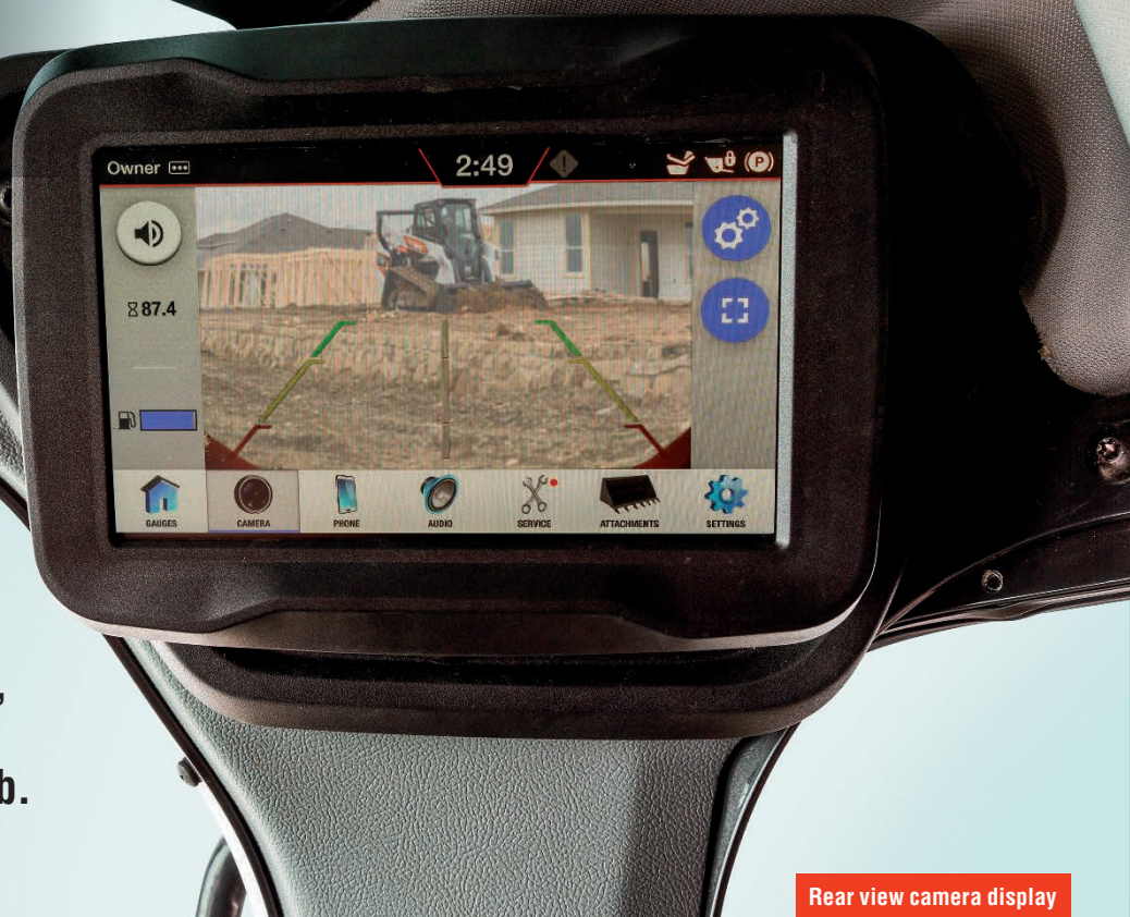
Rear view camera display

New Bobcat display options for R-Series loaders make it easier than ever to change settings, monitor your machine and match performance to the job.